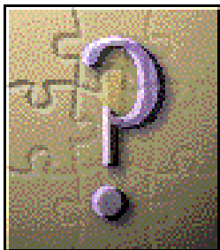
Pres. Kathy says she prefers to remain incognito ...

Taking place in the next few months we have The Beaver Valley Fall Fair in September where we run a penny carnival, The Pancake Breakfast on Thanksgiving weekend at which we normally feed around 150 people pancakes and sausages. December we have our Small Business Christmas dinner slated for mid month.