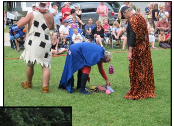
KIDS GAMES ...