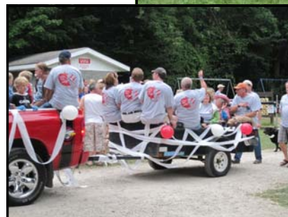
MEAFORD LOVES A PARADE ...