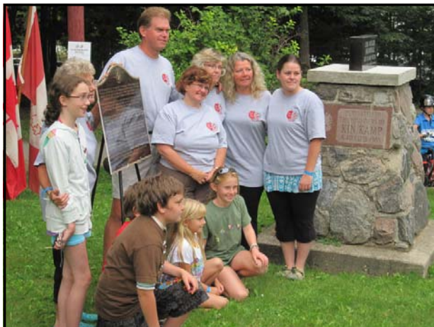
THE MILLER FAMILY, DEDICATION CEREMONY