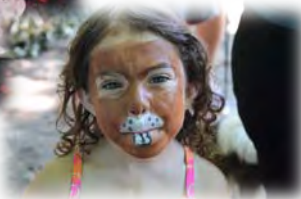
Great Strides for Cystic Fibrosis