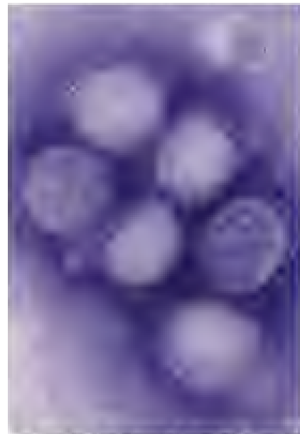
The H1N1 influenza virus.

Y ield to safe and healthy habits — get a good night’s sleep, eat nutritious foods, exercise often, manage stress and drink plenty of fluids.