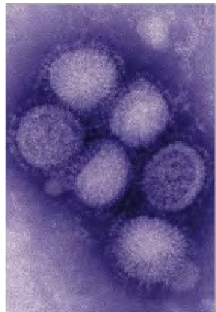
The H1N1 influenza virus.

Y ield to safe and healthy habits — get a good night's sleep, eat nutritious foods, exercise often, manage stress and drink plenty of fluids.