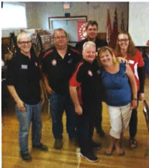
Club Leadership Seminar, Palmerston