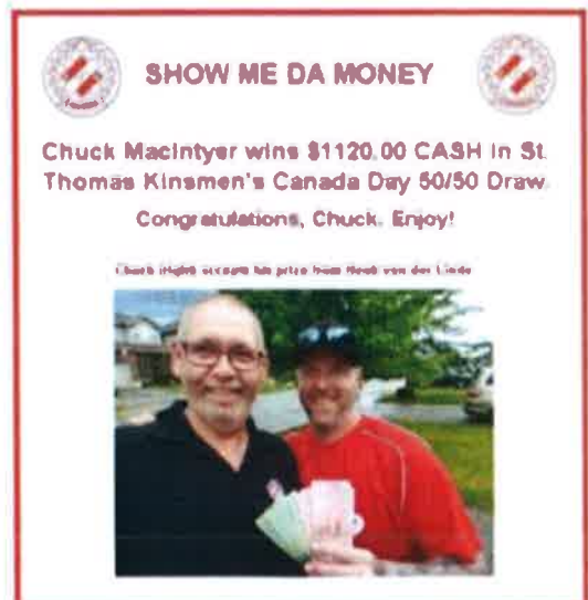
Canada Day, St. Thomas