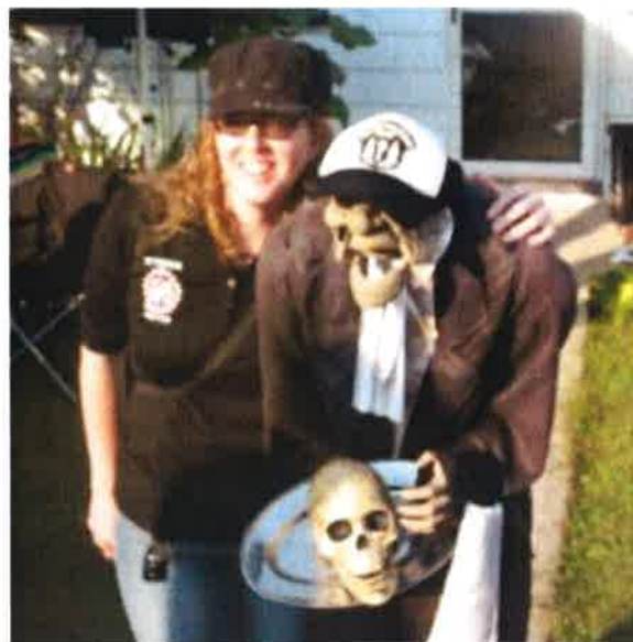
Friday the 13 th , Port Dover